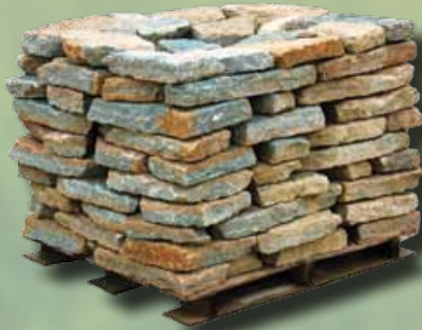
Wall Stones Select Wall Stone 2" 1.75"-2.5" thick

Quality, Consistency, & Integrity that you can always depend on.