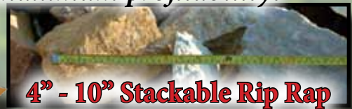
4" - 10" Stackable Rip Rap