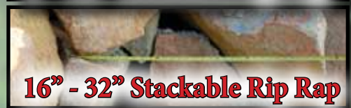
16" - 32" Stackable Rip Rap