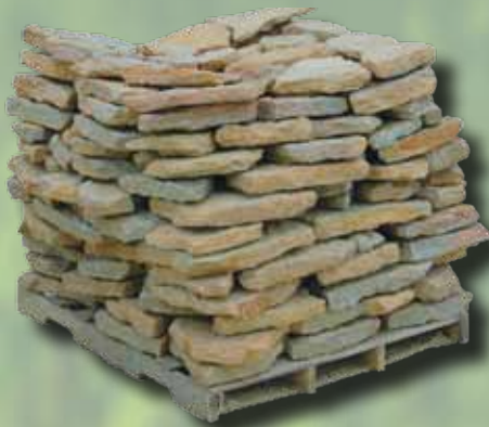
Select Wall Stone 3" 2.5"-3.5" thick (Pictured at left)