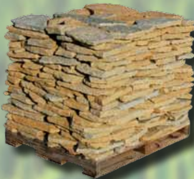
Steppers/Shims 1" - 2" thick 8" - 28" diameter (Pictured at left)