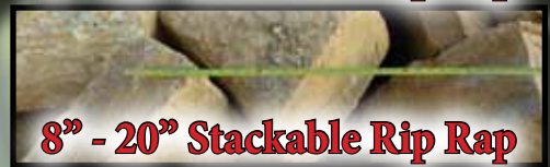
8" - 20" Stackable Rip Rap