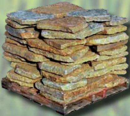
Regular Large Flagging 2.5"-3.25" thick 15"-48" Diameter (Pictured at left)